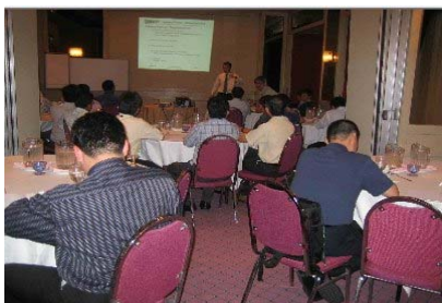
Wireless Security Risks Seminar at Asia Speaker Bureau (ASB)

What do you do if someone takes over your Mobile Phone via the wireless network ?